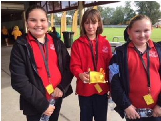
Engineering & Robotics