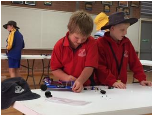
Making, then Racing the Solar Car