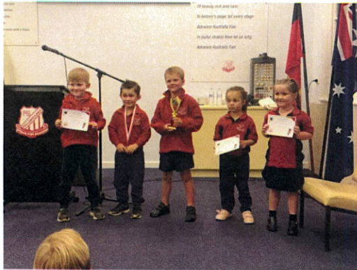
Early Stage 1