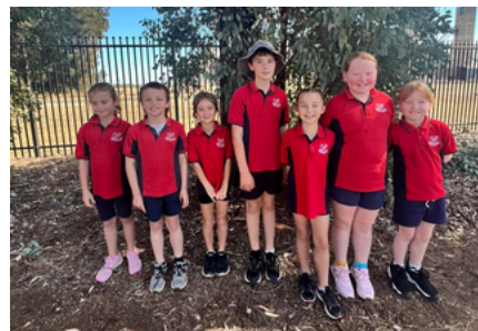
COMBINED ATHLETICS CARNIVAL RESULTS 2023

Permission notes have been sent home with all our girls, please complete and return to school as soon as possible. Thank you for your support.